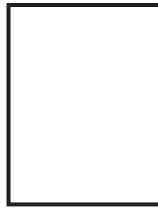
TBA Citizen-At-Large TBA Term Expires: 2006